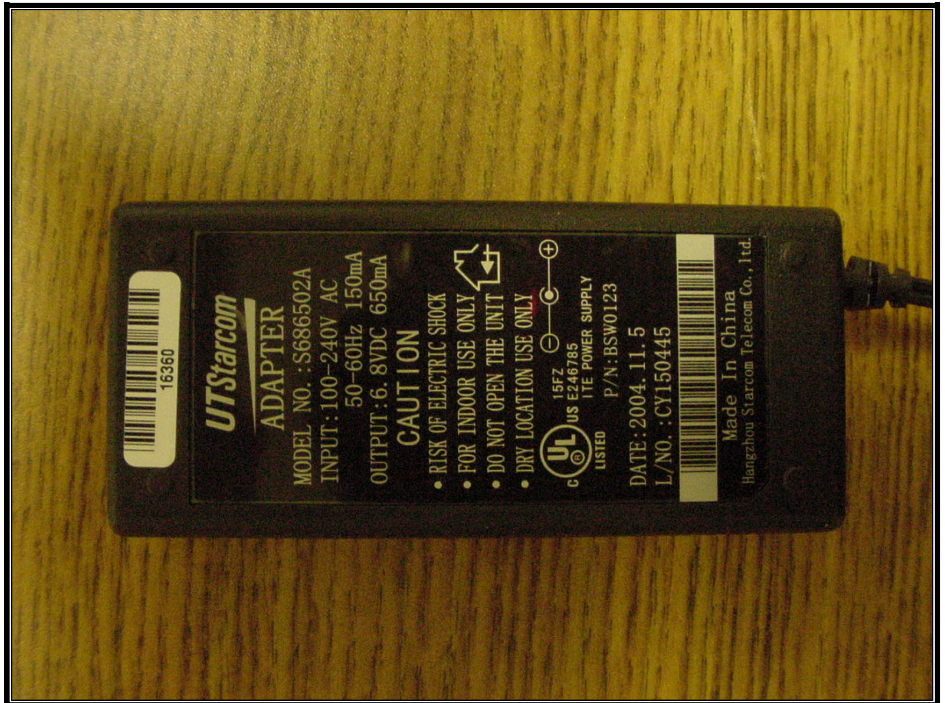
PHOTOGRAPH 15: 6.8 V DC POWER SUPPLY