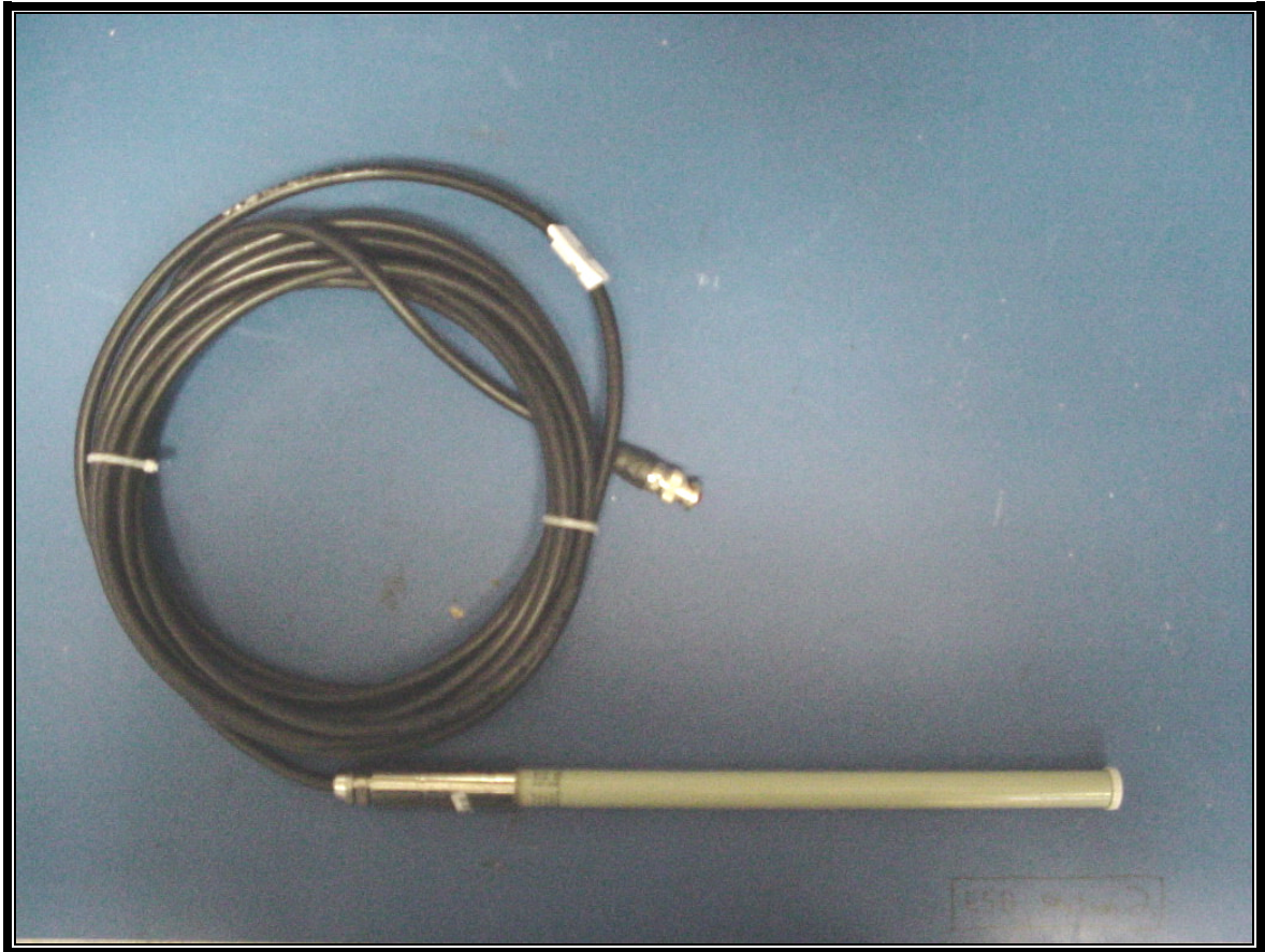
PHOTOGRAPH 14: ROD ANTENNA