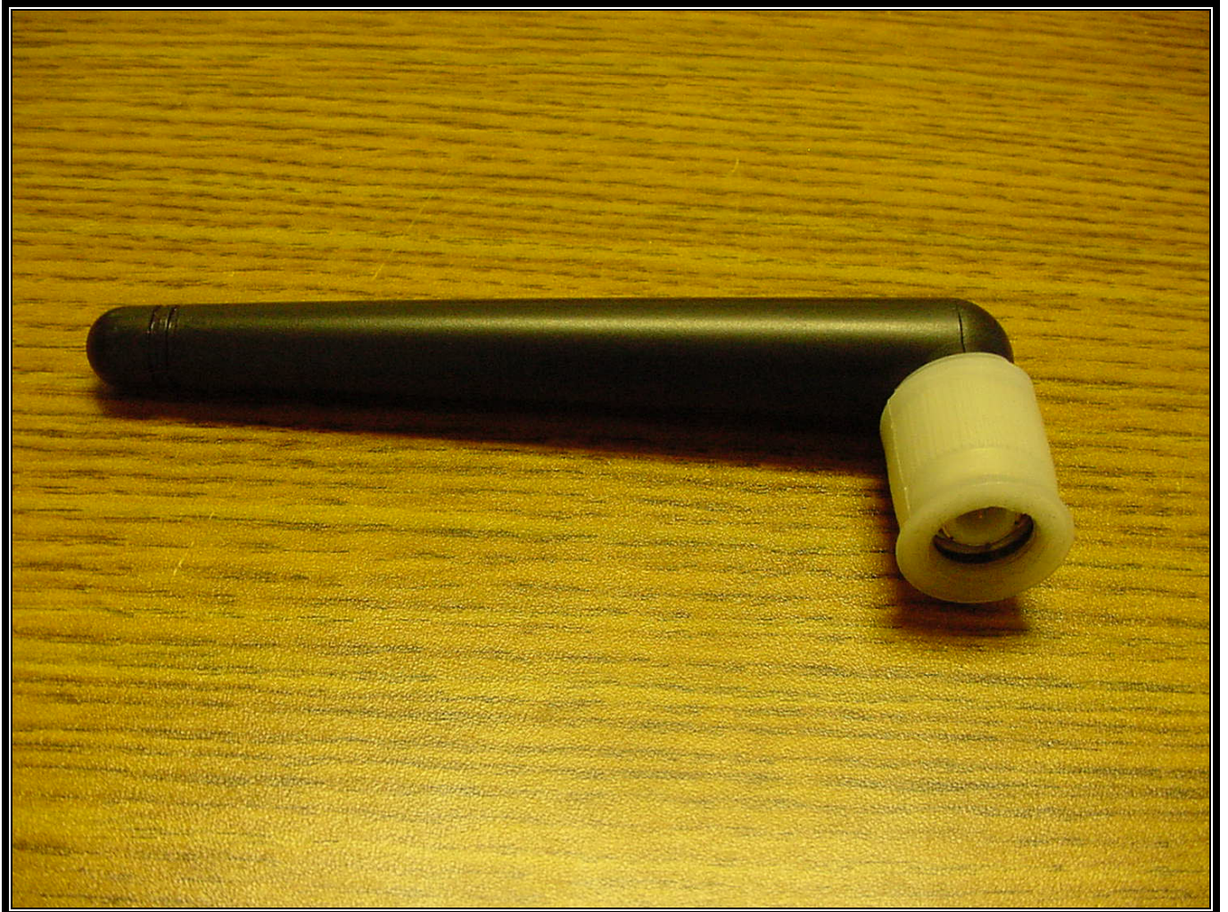
PHOTOGRAPH 12: WHIP ANTENNA