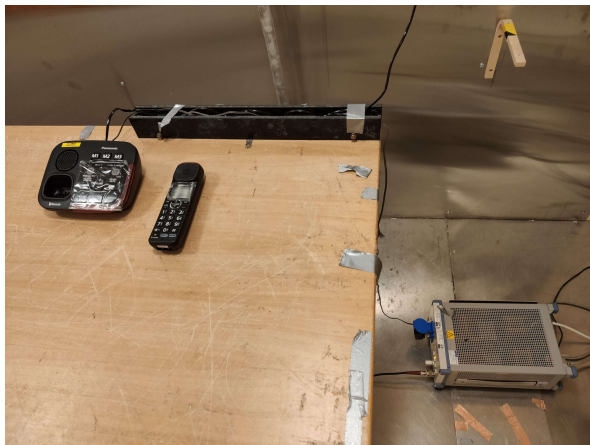
Power-Line Conducted Emissions