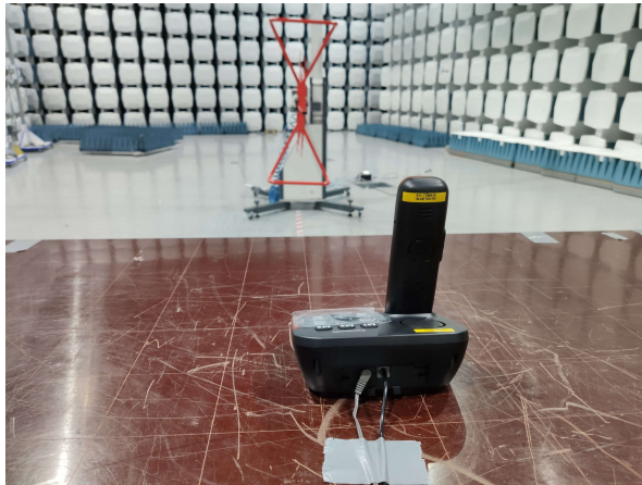
Radiated Emissions 30 – 1000 MHz