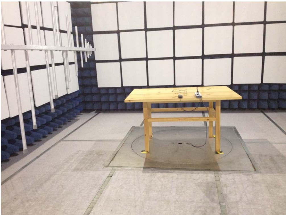
30MHz to 1GHz