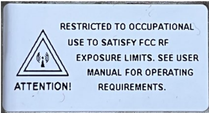
RF Exposure Label