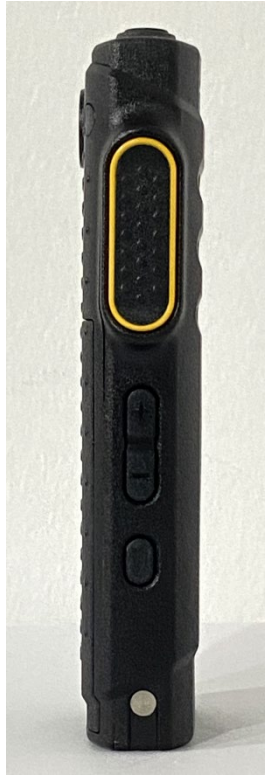
Side view (Right) with Battery & Battery Cover (SL300 - Display model)