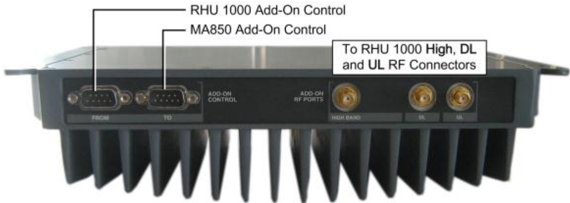
Figure 2. AWS1200 AO Rear Panel

The RHU 1200 rear panel contains the connections to the RHU 1000 and MA 850.