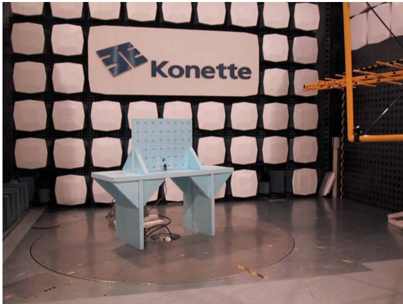
Picture 2: Radiated spurious emission measurement set-up for below 3 GHz measurements, EUT in vertical orientation