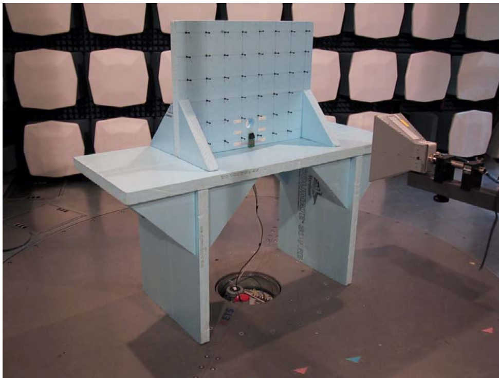
Picture 3: Radiated spurious emission measurement set-up for above 3 GHz measurements, EUT in vertical orientation