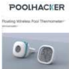
User Manual *1 用户说明书 *1