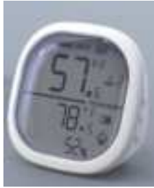
Temperature and Humidity Monitor (Receiver) 温度湿度监测仪（接收器）