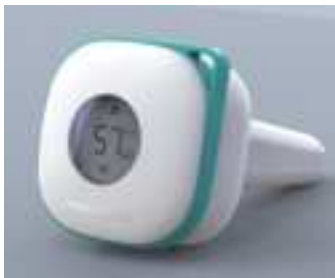
Pool Thermometer (Transmitter) 泳池温度计（发射器）