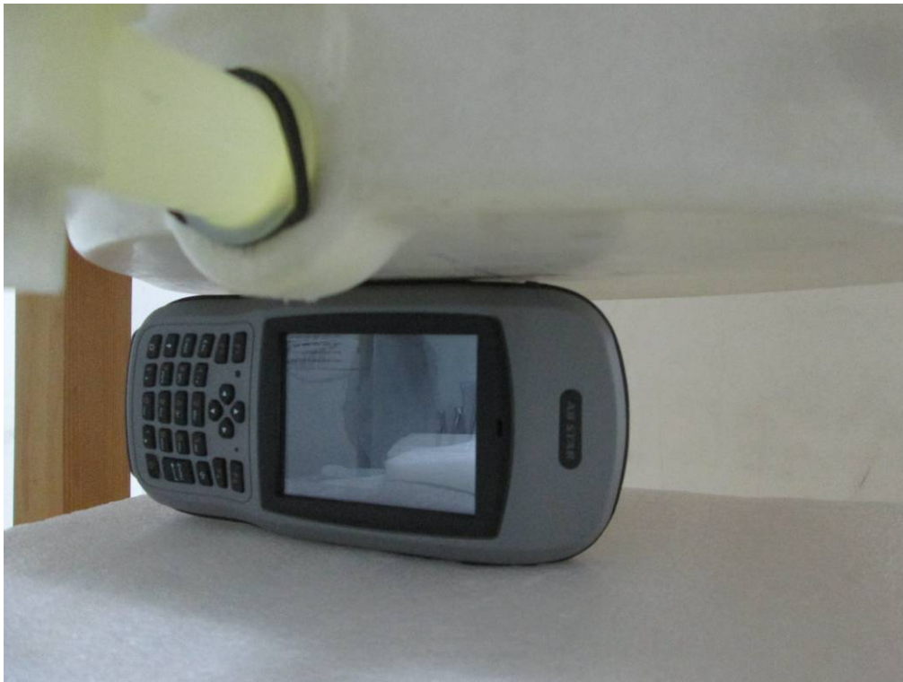
Body-worn Right Setup Photo (0mm)