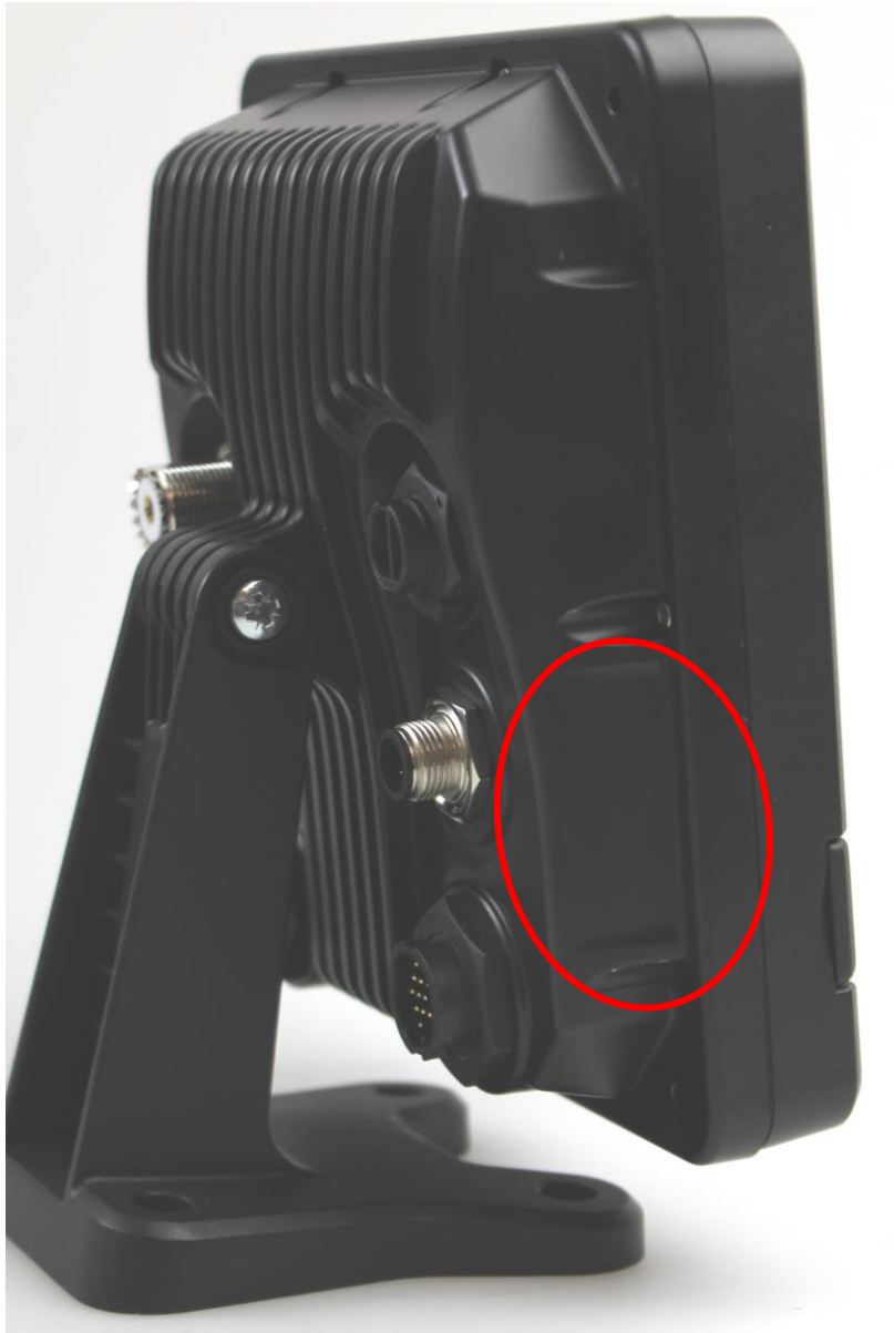
Figure 1 – Rating label position