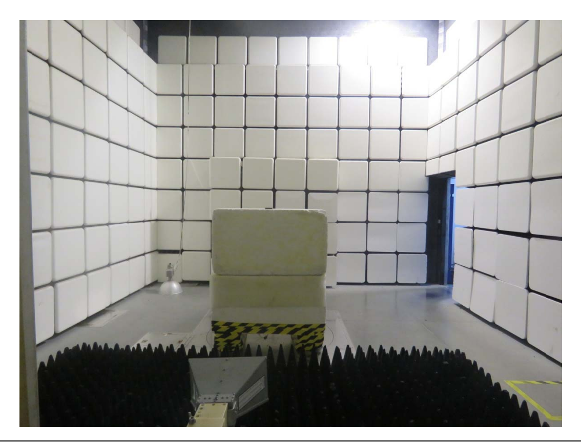
TA Technology (Shanghai) Co., Ltd. TA-MB-04-005R Pa This report shall not be reproduced except in full, without the written approval of TA Technology (Shanghai) Co., Ltd. Page 1 of 3