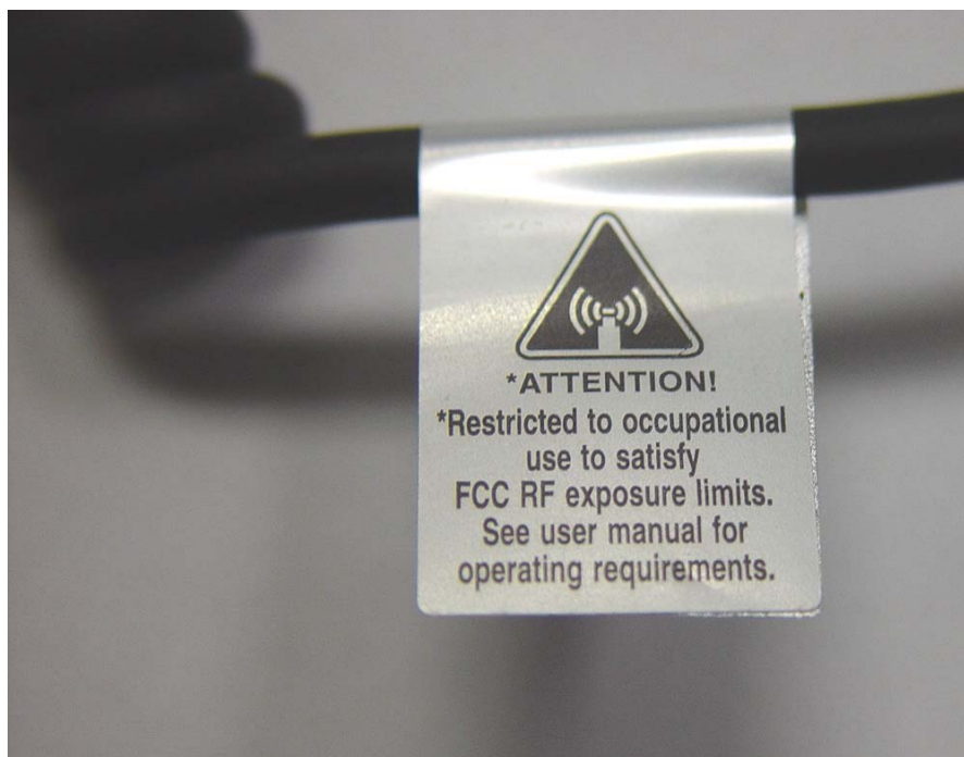
Figure 3-6: Close-Up of RF Safety Label