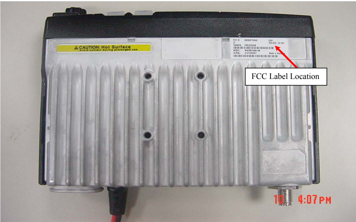
Figure 3-4: Rear view of complete radio showing FCC Label location.