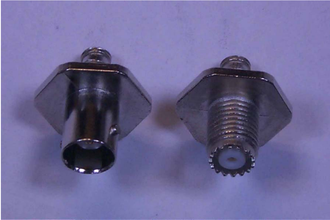
Figure 3-6: Antenna connector options, BNC on left, mini-UHF on right.