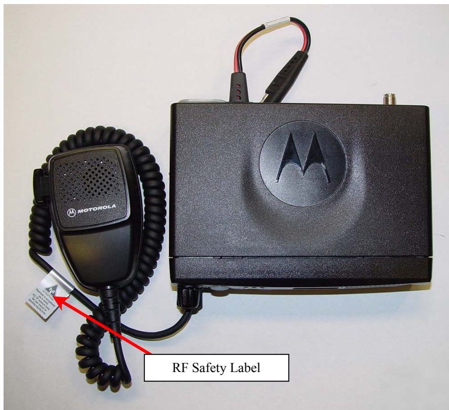
Figure 3-5: RF Safety Label Location; attached at Microphone cord.