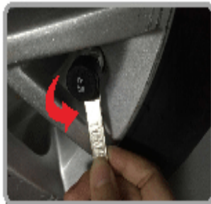
With the tools of lock nut, and ensure close to the sensor