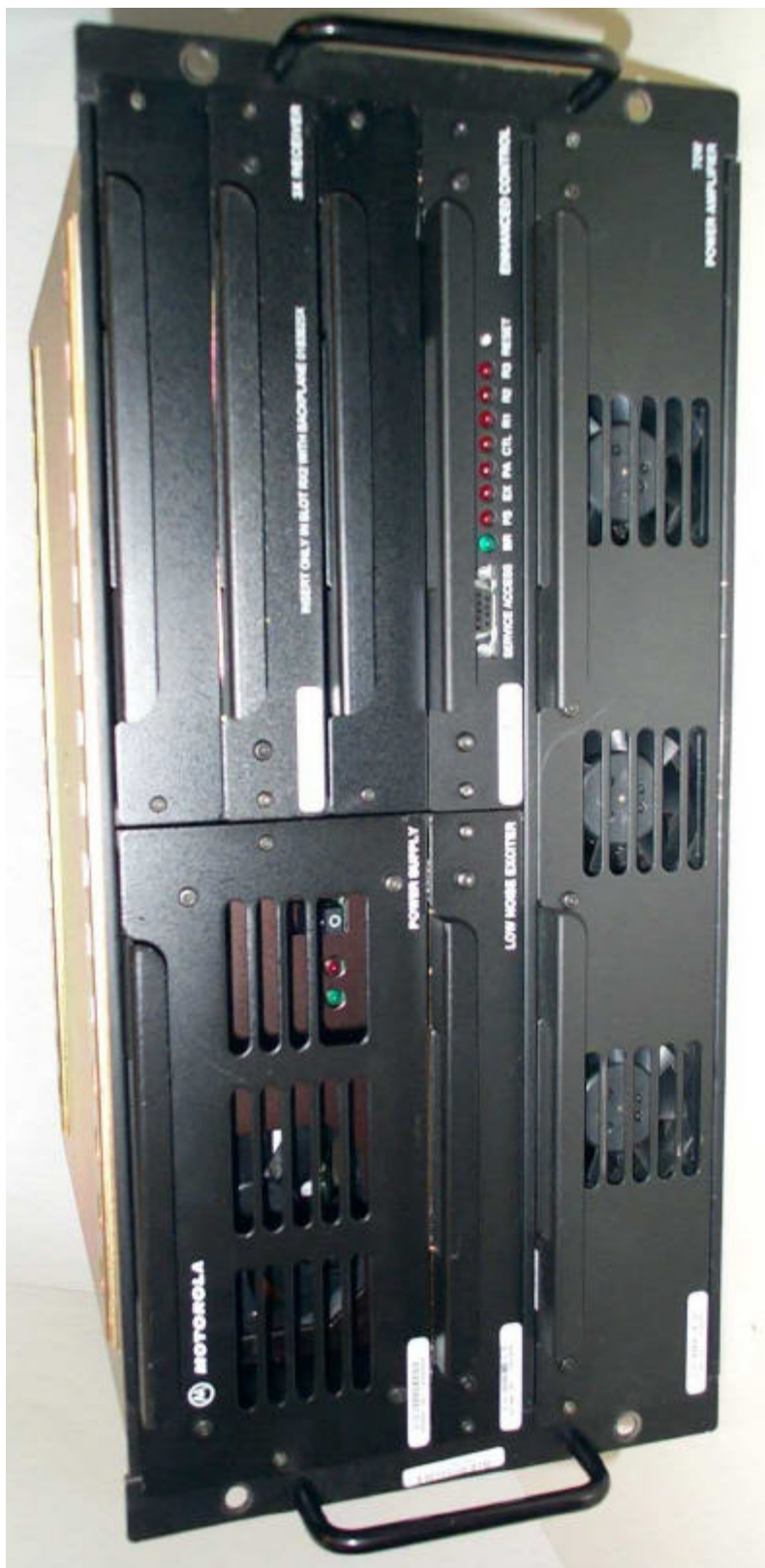
Base Radio -- Front View