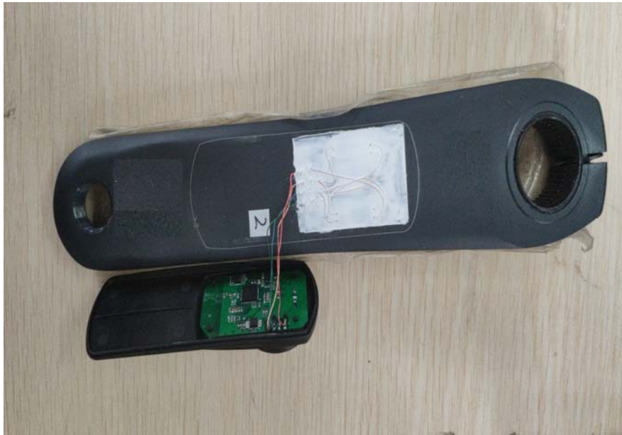
EUT – Cover off PCB Top View