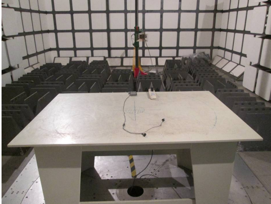
Radiated Emissions – Rear View (Above 1GHz)