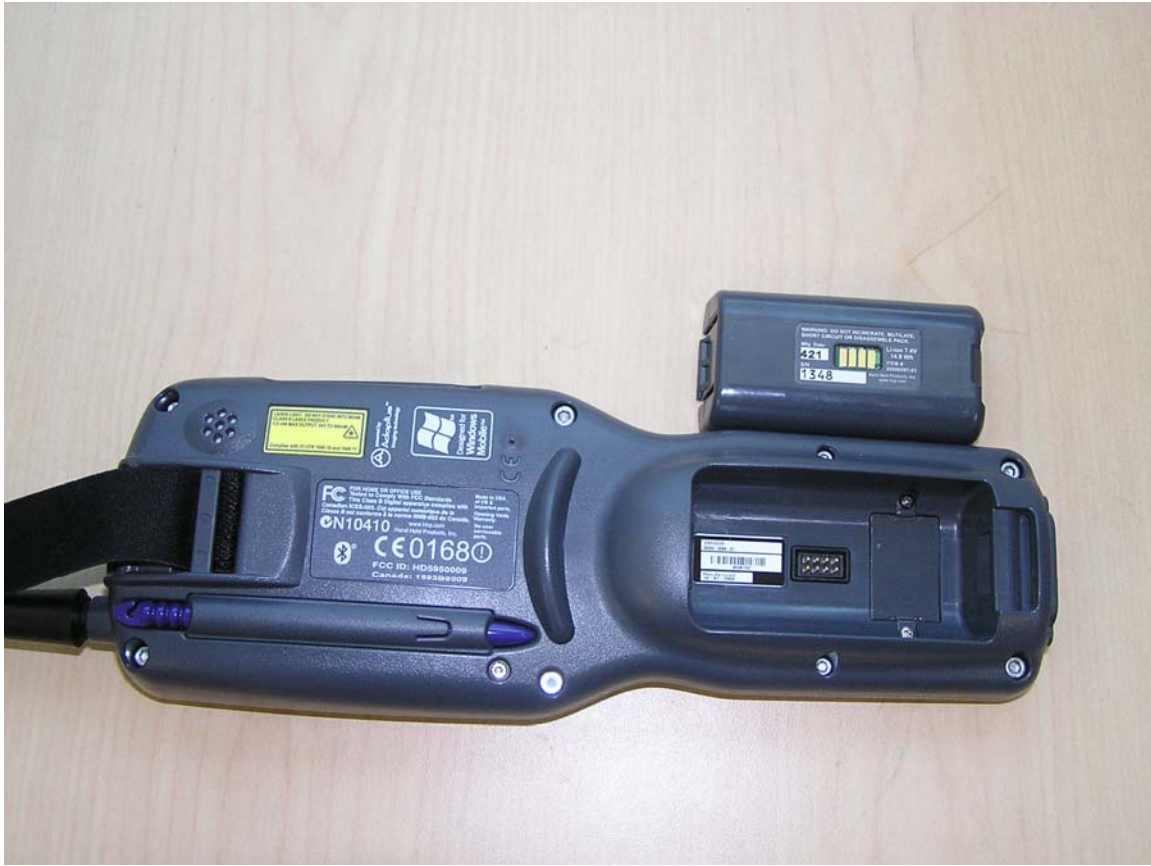
EUT – Bottom view