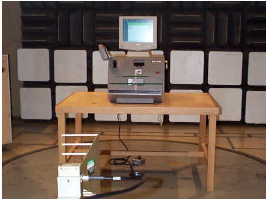
Radiated Emissions (1-5 GHz)