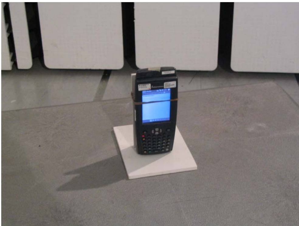
Radiated Emissions Test Setup