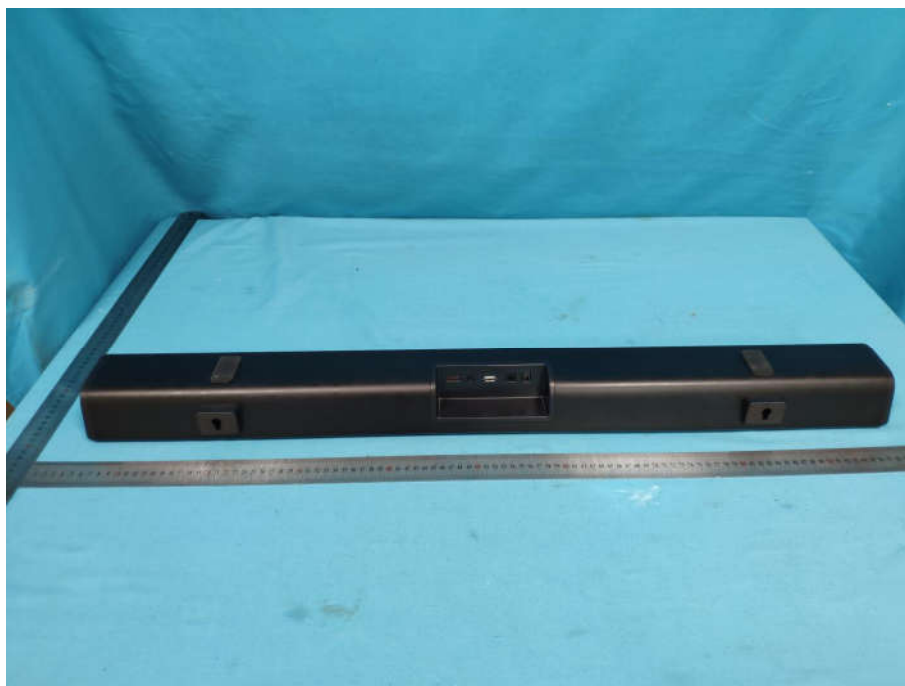
View of Product-3