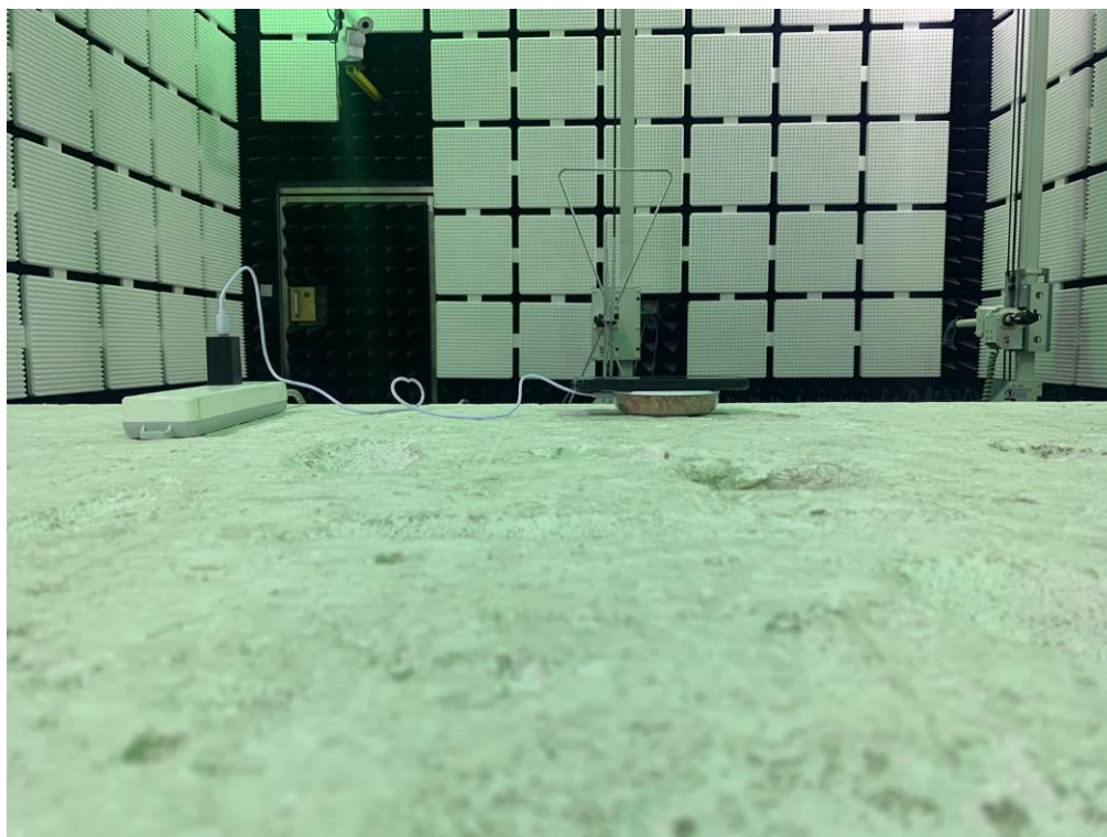
Radiated Emission Below 1 GHz