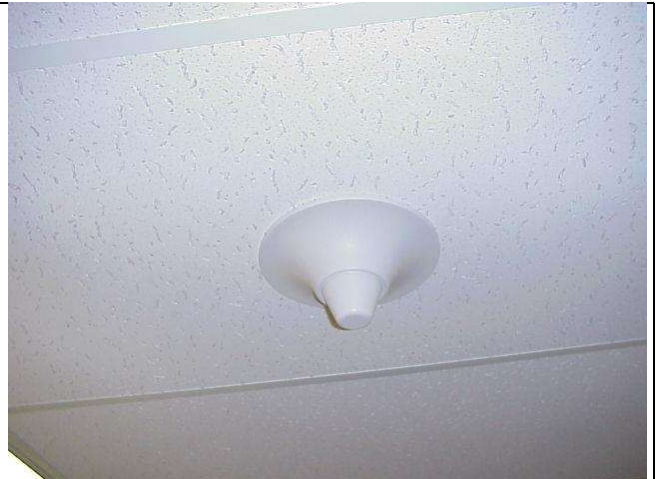
4. MA-CM36-15 (Typical antenna installation)