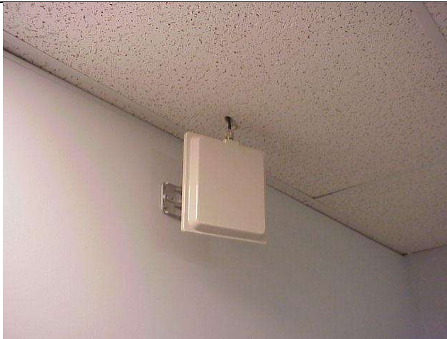
2. MA-CL67-15 and MA-CL92-5 (Typical antenna installation)