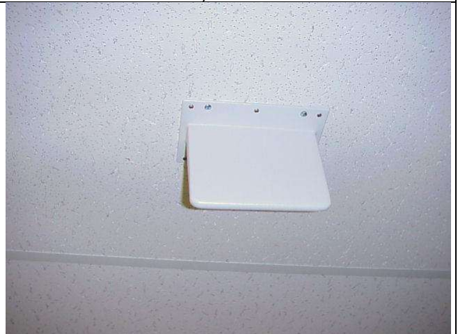
3. MA-CC60-60 (Typical antenna installation)