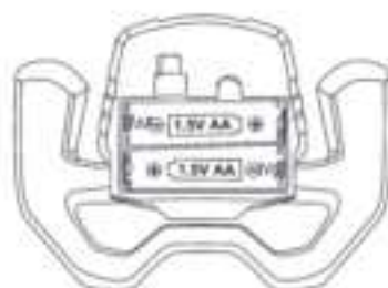
2 x AA Batteries (Not included)