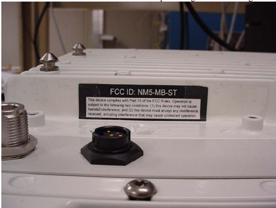
Figure 2: Label Location

The label location on the exterior of the Marquee Bridge is shown in Figure 2.