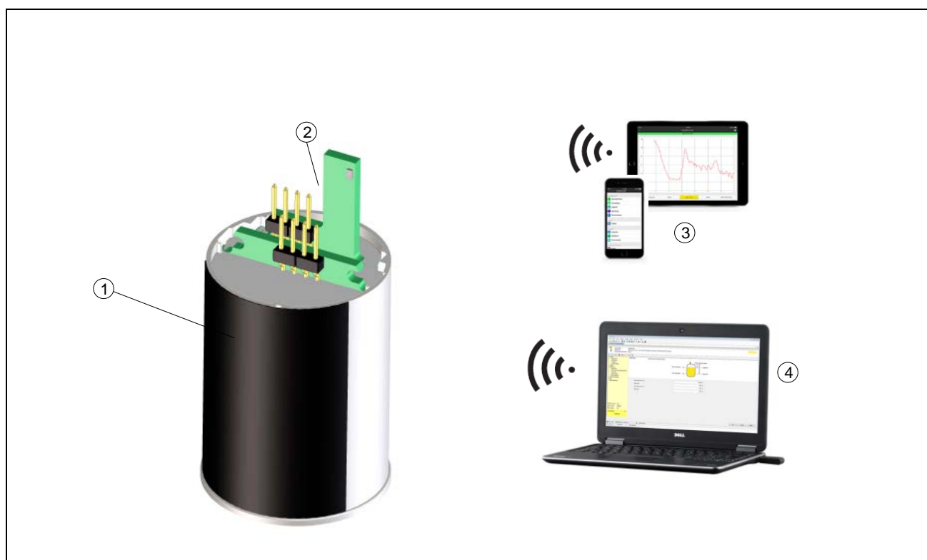
Fig. 8: Bluetooth connection to standard operating devices