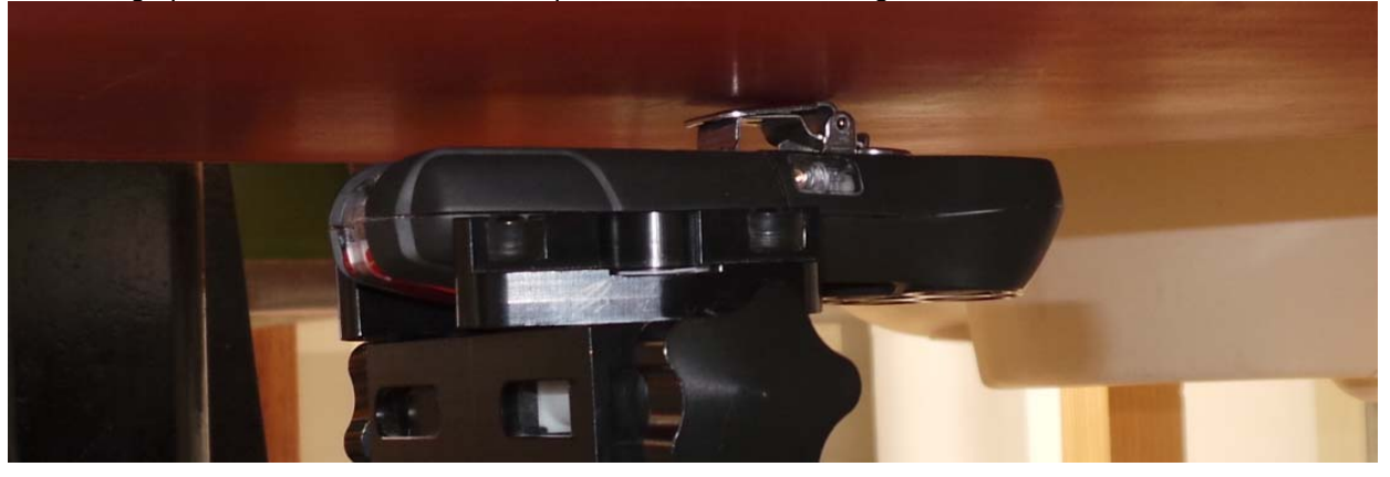
Photograph Number 18. G7x Belt Clip O2 CO H2S LEL Cartridge

Photograph Number 17. G7x Belt Clip O2 CO H2S LEL Cartridge