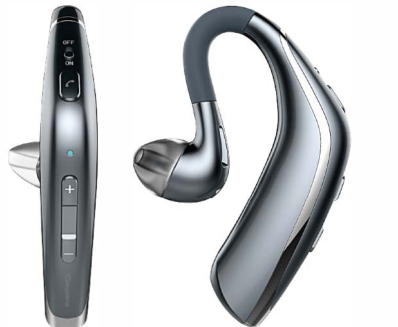
Manual for using smart Bluetooth Earphone