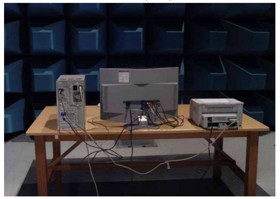
Radiated Emission (Rear) Picture