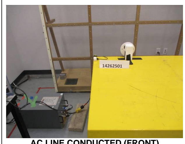
AC LINE CONDUCTED (FRONT)