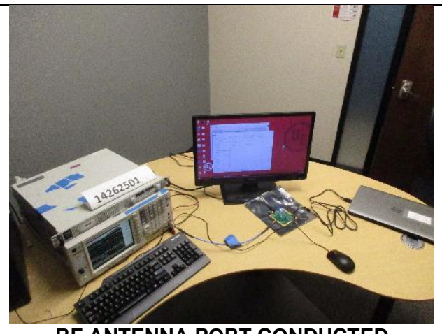
RF ANTENNA PORT CONDUCTED