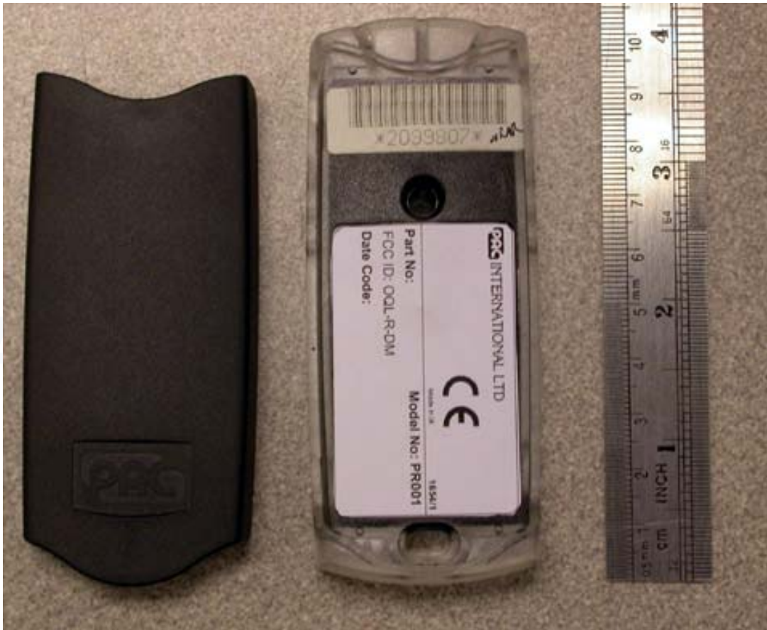
LABEL POSITION (FRONT)