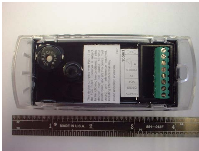
LABEL POSITION (REAR)