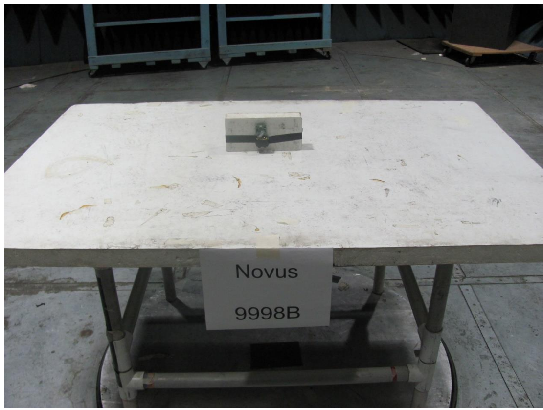
The EUT was taped to a foam block in order to change the axis of rotation.