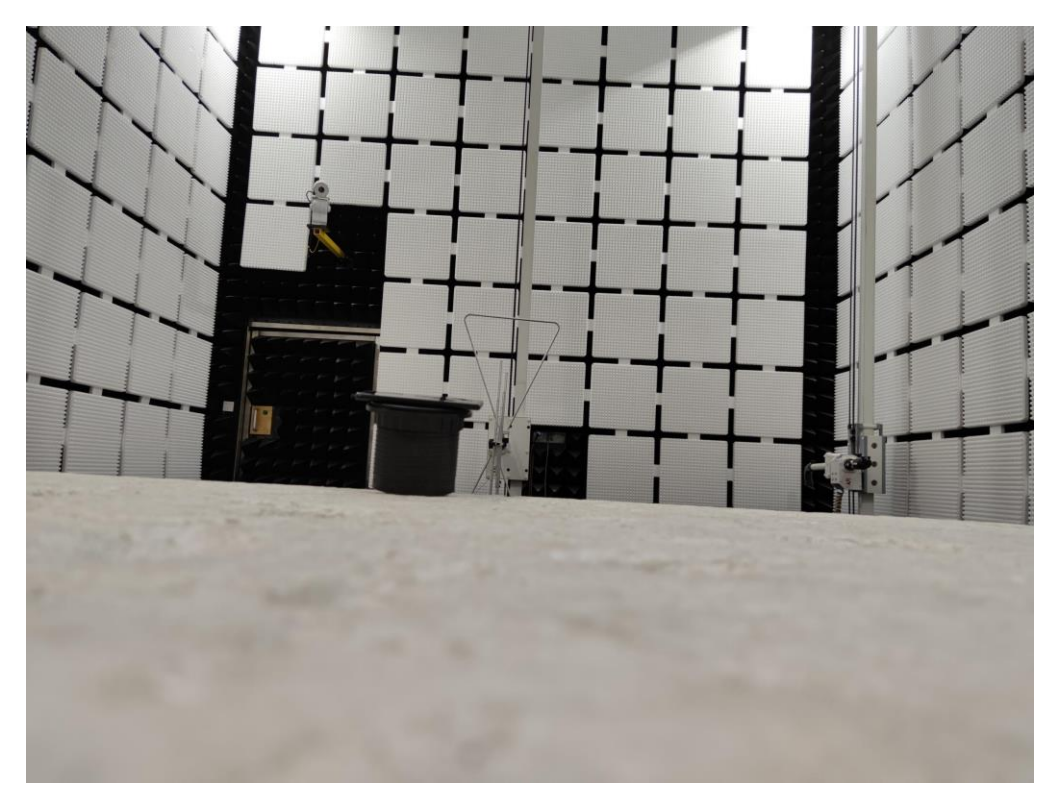
Radiated Emission below 1GHz-AC adapter charge mode