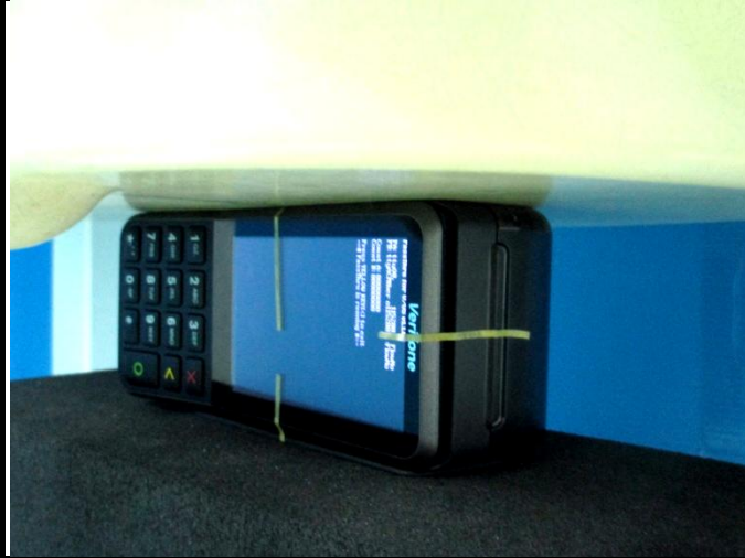
Left Side of EUT with 0 cm Gap