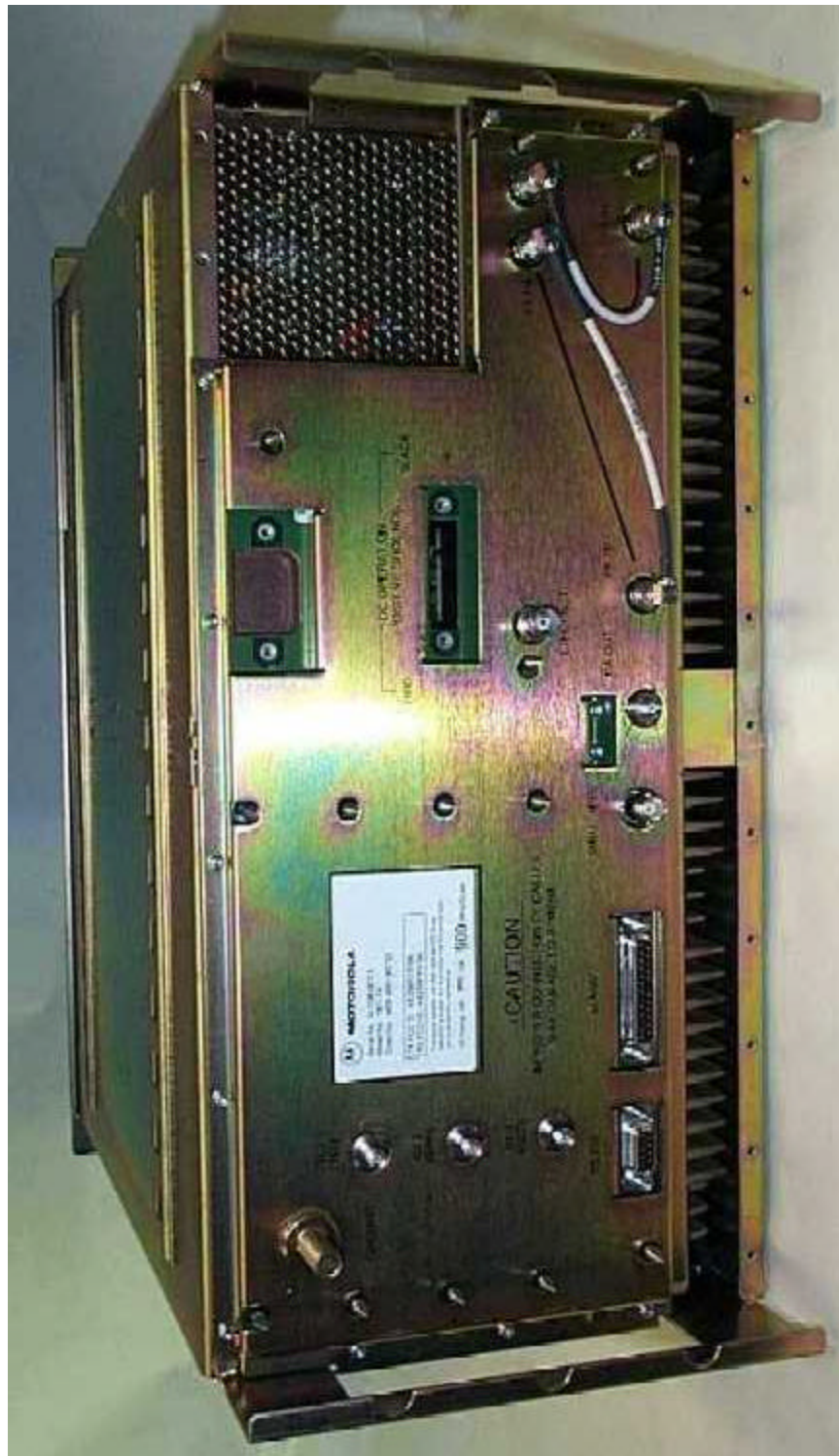
Rear of Quad Base Radio Including Location of the FCC ID Label