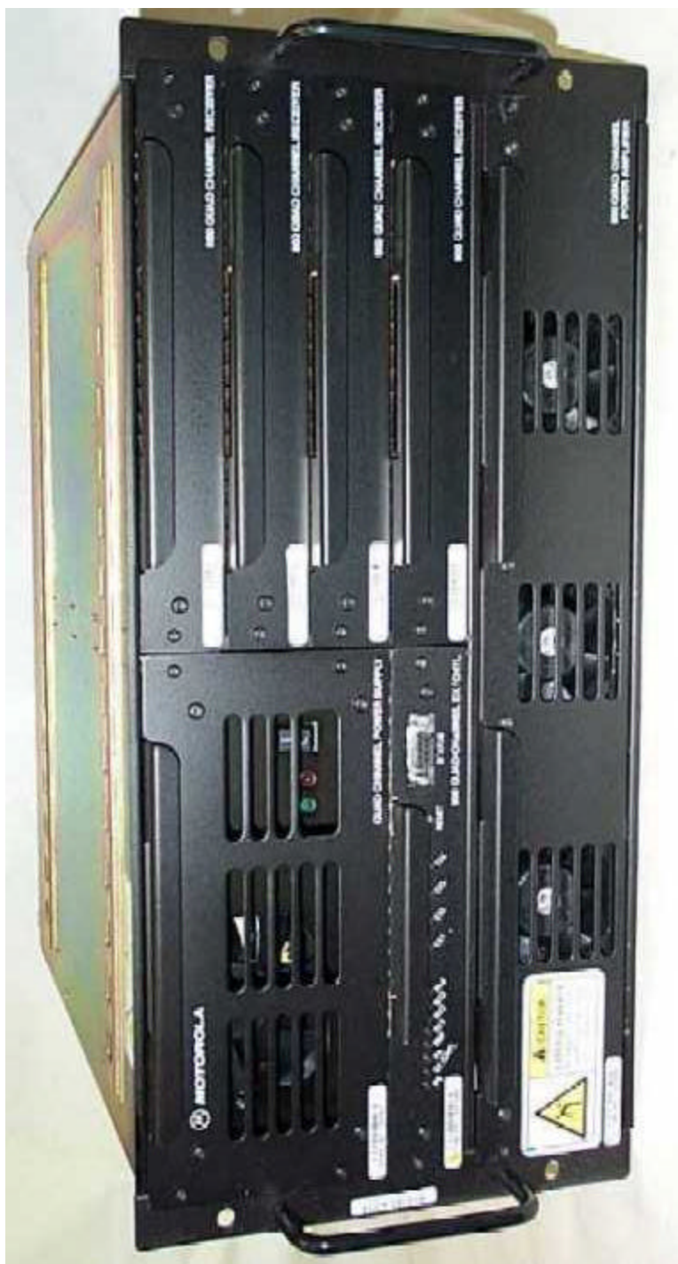
Quad Base Radio -- Front View