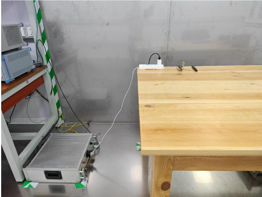
Radiated band edge emission Radiated Spurious Emission (Above 1GHz)