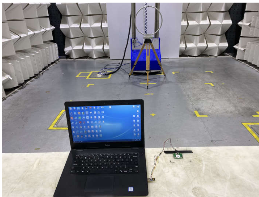
Radiated spurious emission Test Setup-1(Below 30MHz)