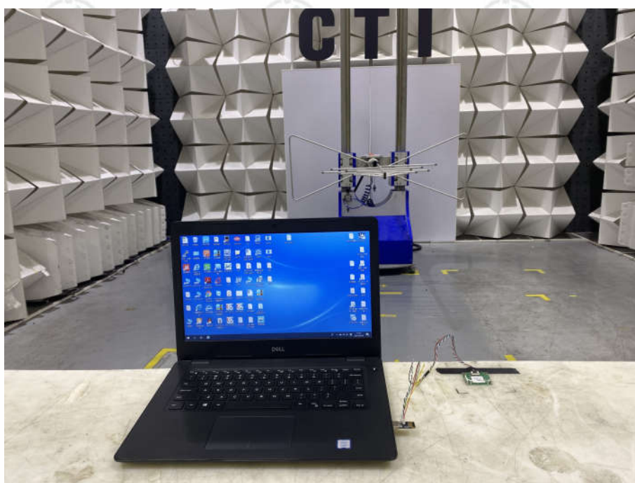
Radiated spurious emission Test Setup-2(Below 1GHz)