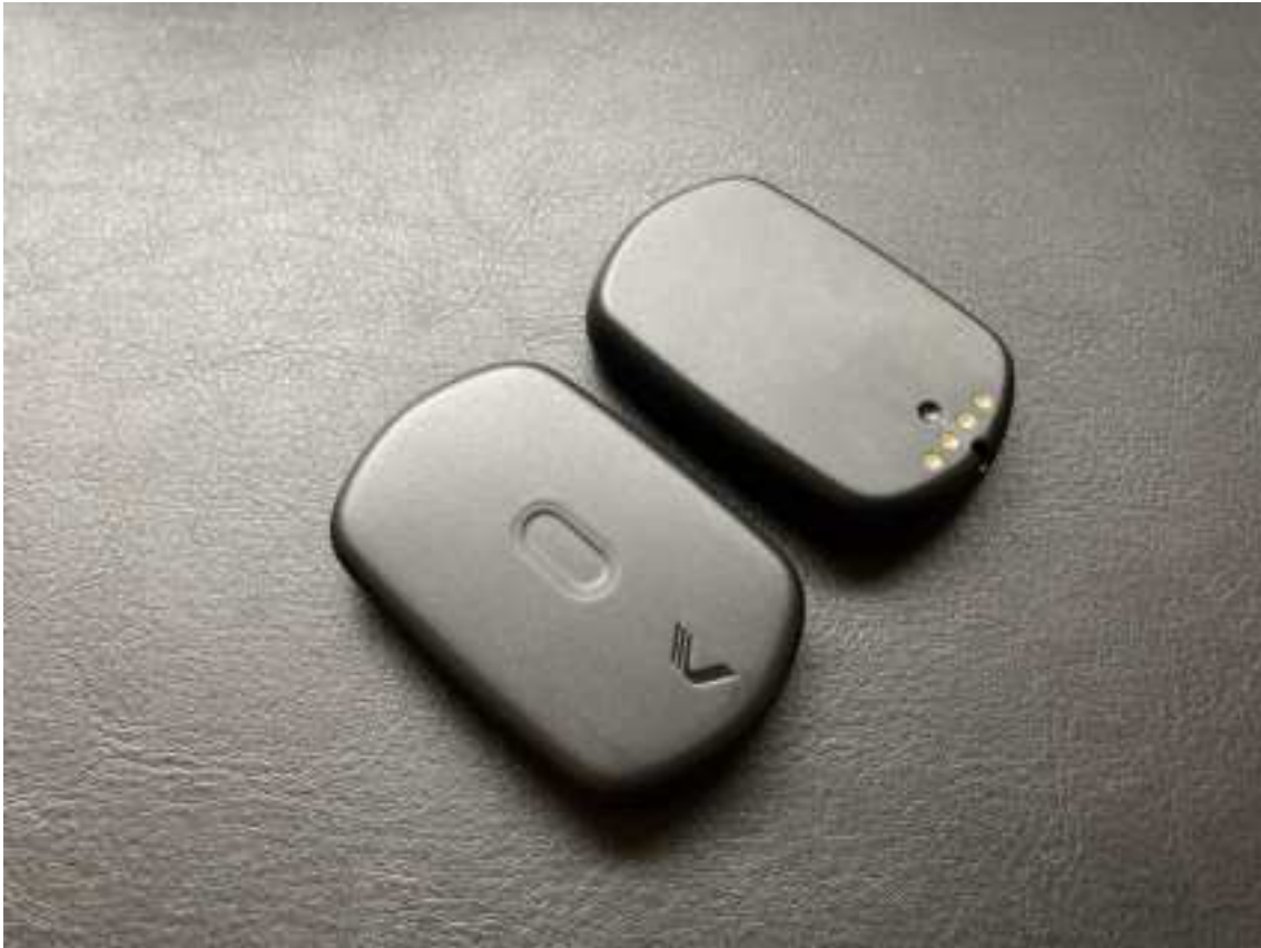
Figure 1. – T7 wearable Device