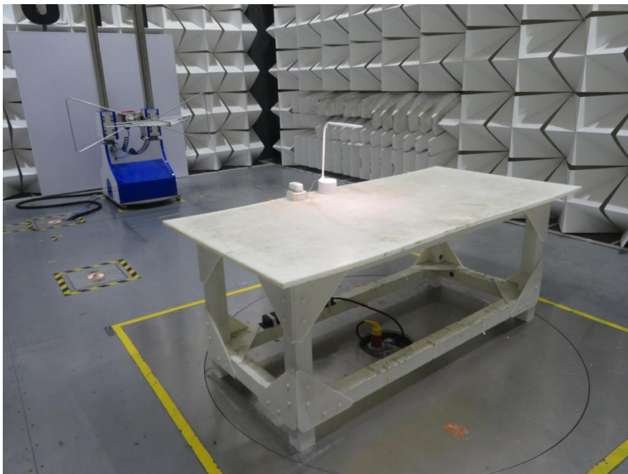
Radiated spurious emission Test Setup-2(30MHz-1GHz)