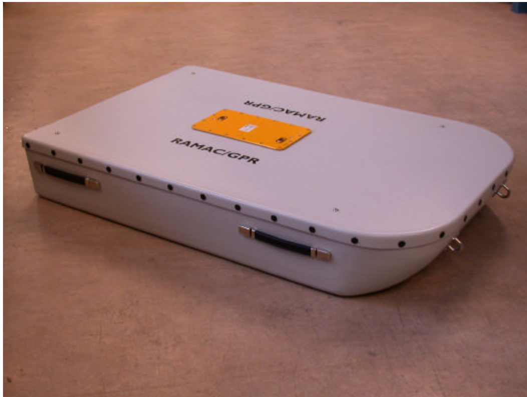
Figure 4. A 100MHz shielded antenna