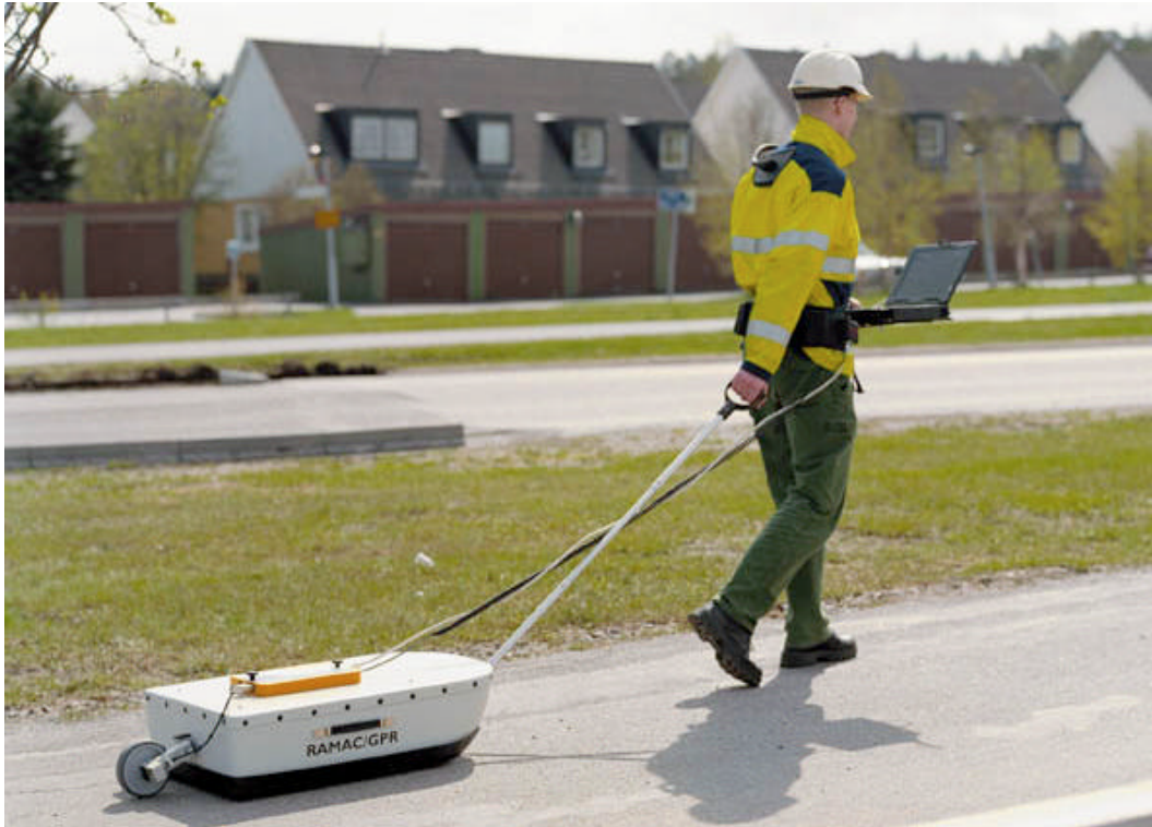
Figure 2. EasyLocator mounted on antenna with wheel and pulling handle.