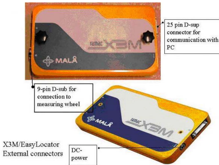
Figure 1. An X3M unit. An EasyLocator has identical connectors but different colour and label.