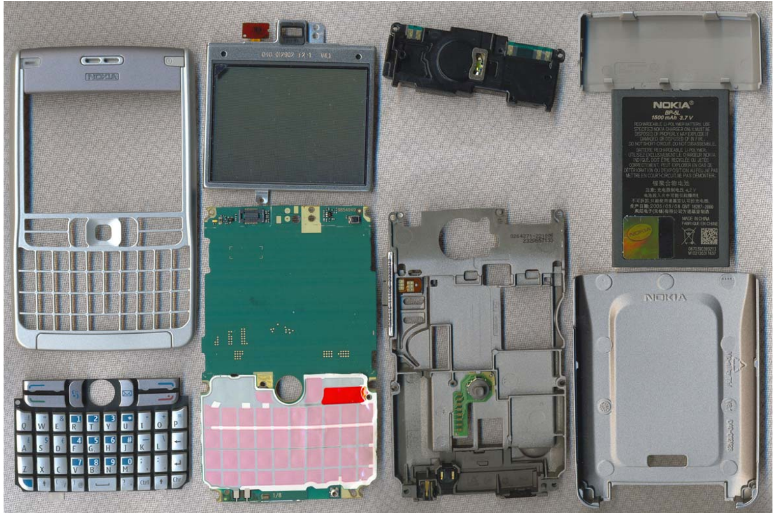
Exhibit 09: Internal Photos CMT PYARM-89