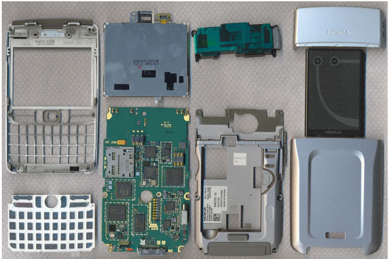
Exhibit 09: Internal Photos CMT PYARM-89