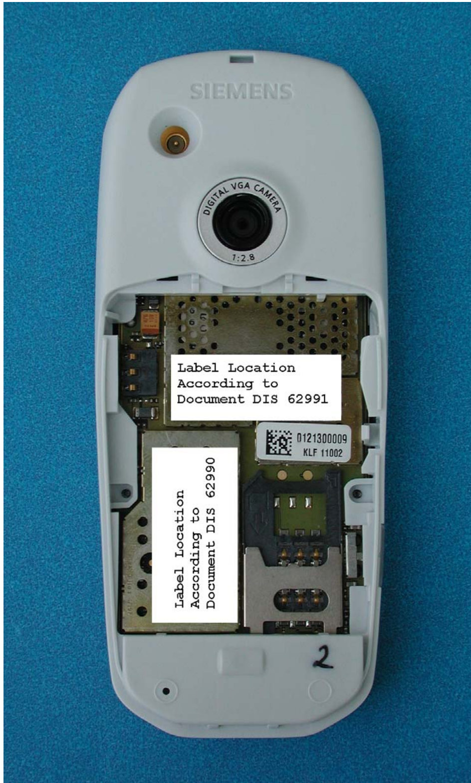
CX65 IMEI LABEL and LABEL LOCATION