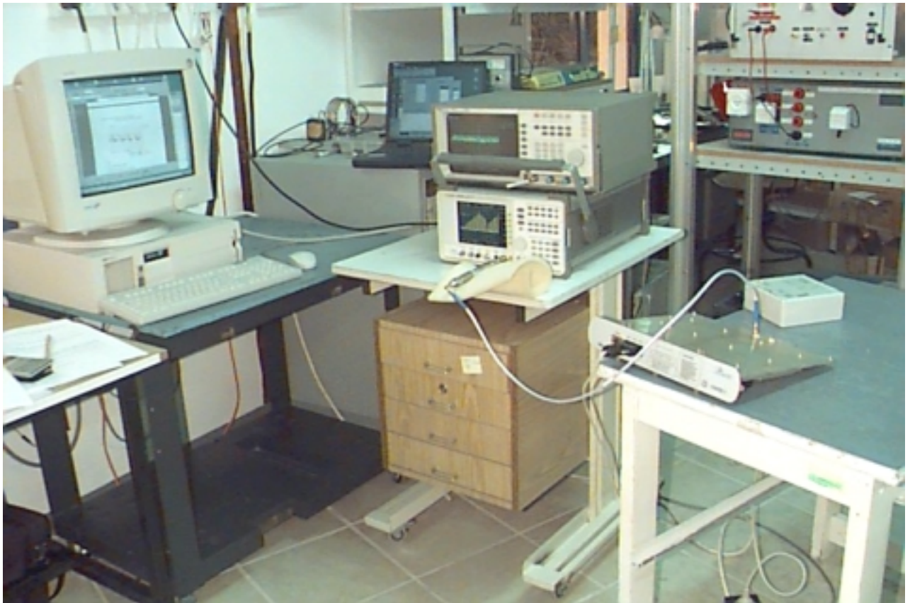
Photograph No.1 RF conducted emissions measurement test setup