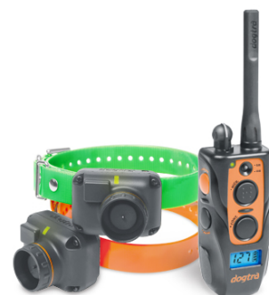
Black color of the case