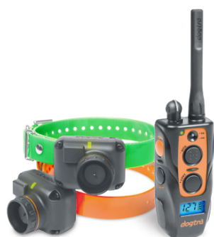
Orange color of the case