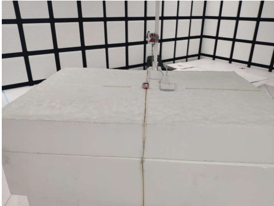
Radiated spurious emission Test Setup-3(Above 1GHz)