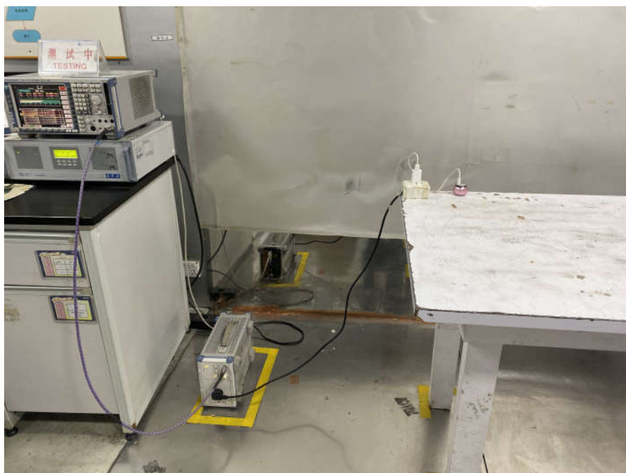
AC Conducted Emissions Test Setup