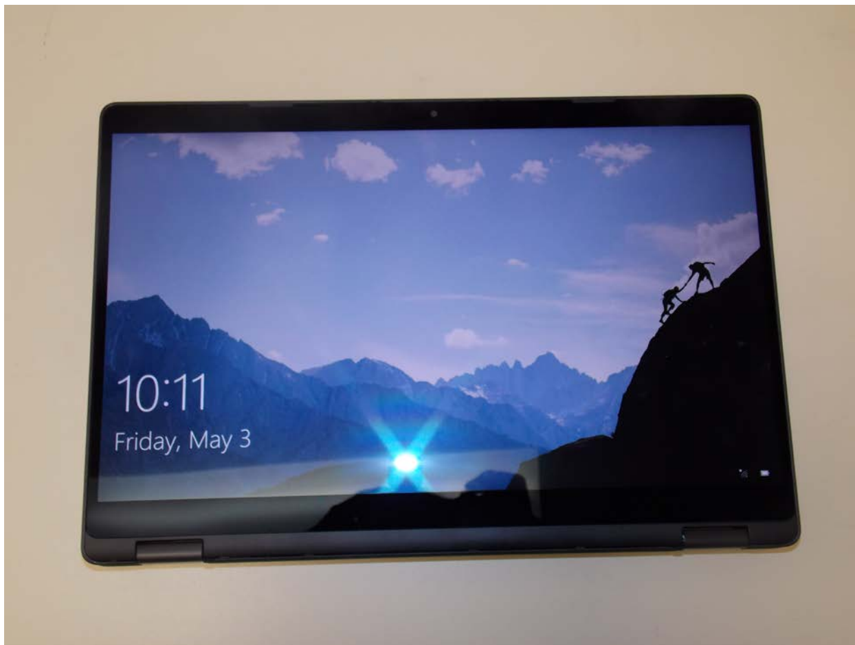
Front of Device Tablet Mode