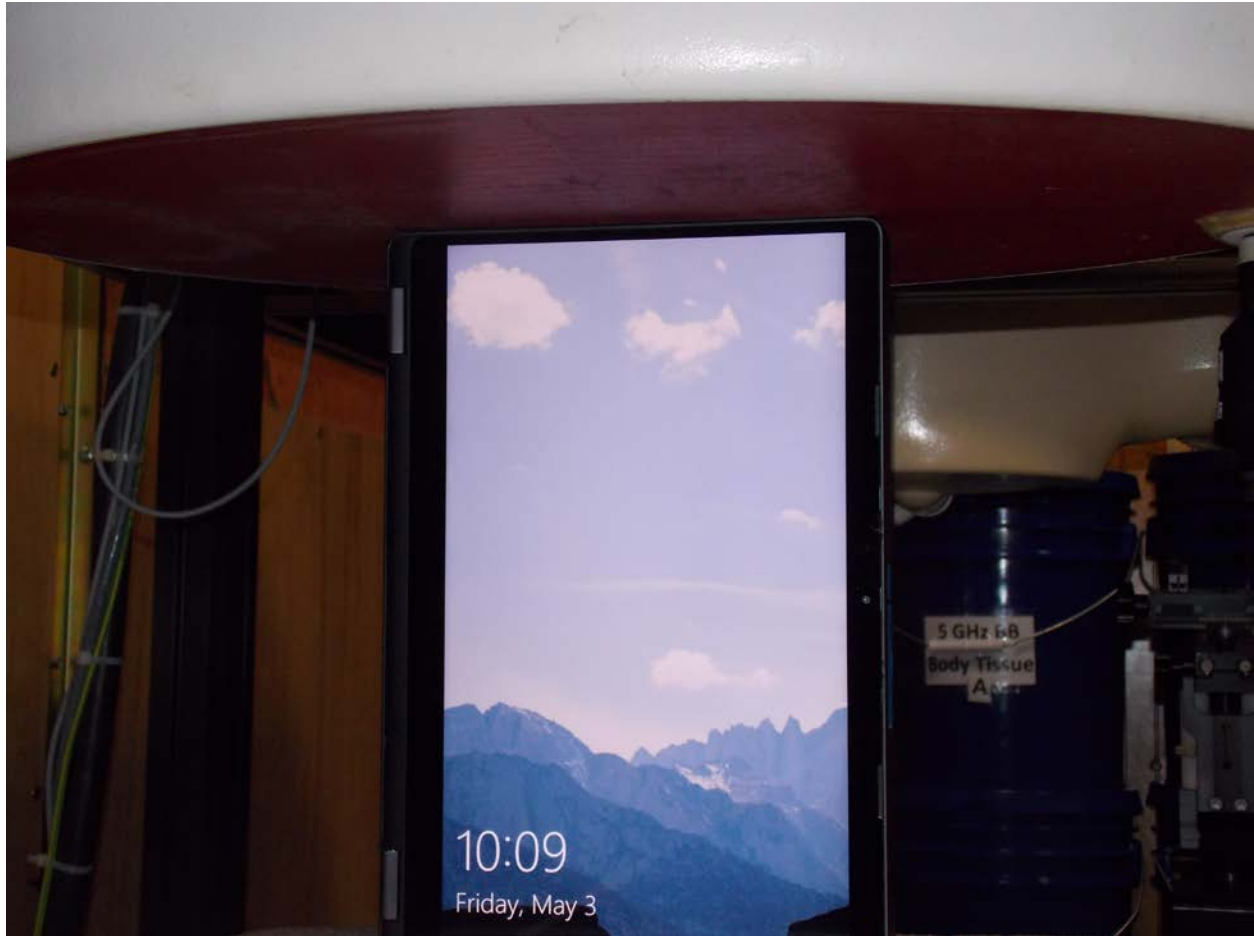
Test Position Bottom (Same for All Configurations) 0 mm Gap