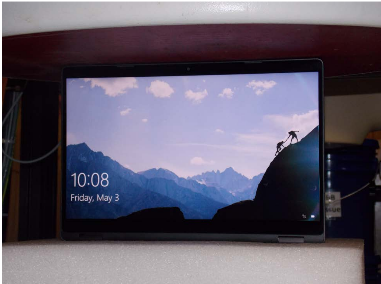
Test Position Top (Same for All Configurations) 0 mm Gap