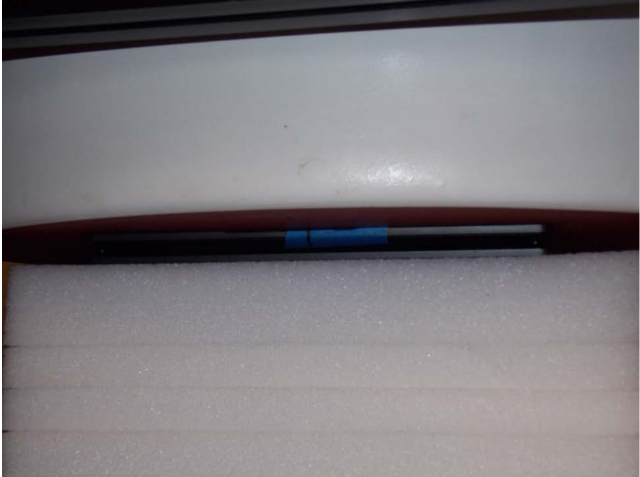
Test Position Back (Same for All Configurations) 0 mm Gap