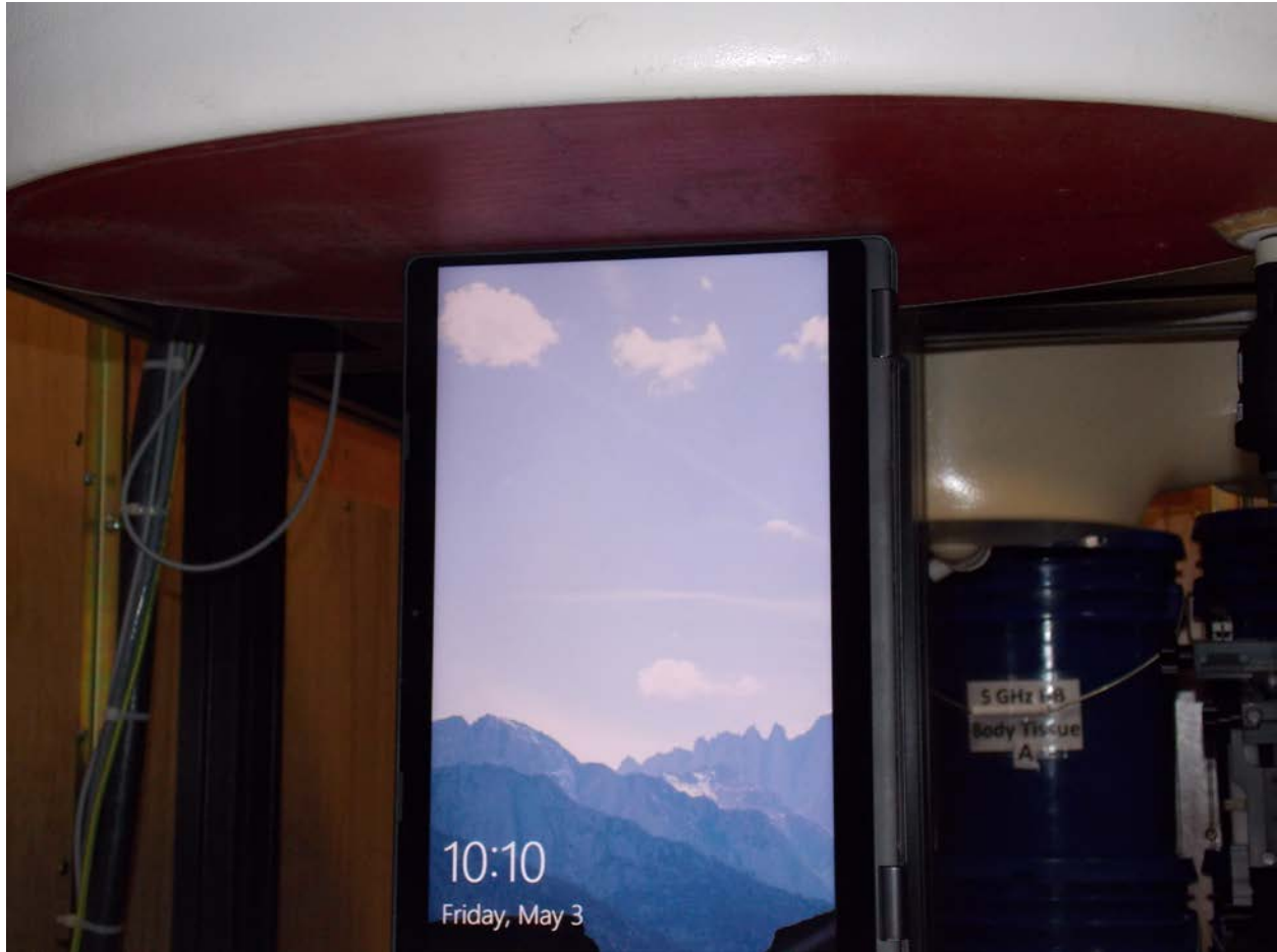
Test Position Right Side (Same for All Configurations) 0 mm Gap