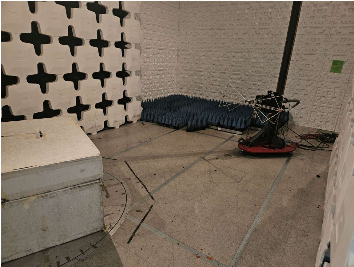
Figure 3. Radiated Emissions Test Setup, 30 MHz to 200 MHz

FCC Part 15 Certification/ RSS 247 O7P-341 10147A-341 24-0073 July 18, 2024 Inventek Systems ISM4334X-M4G-L44 Module