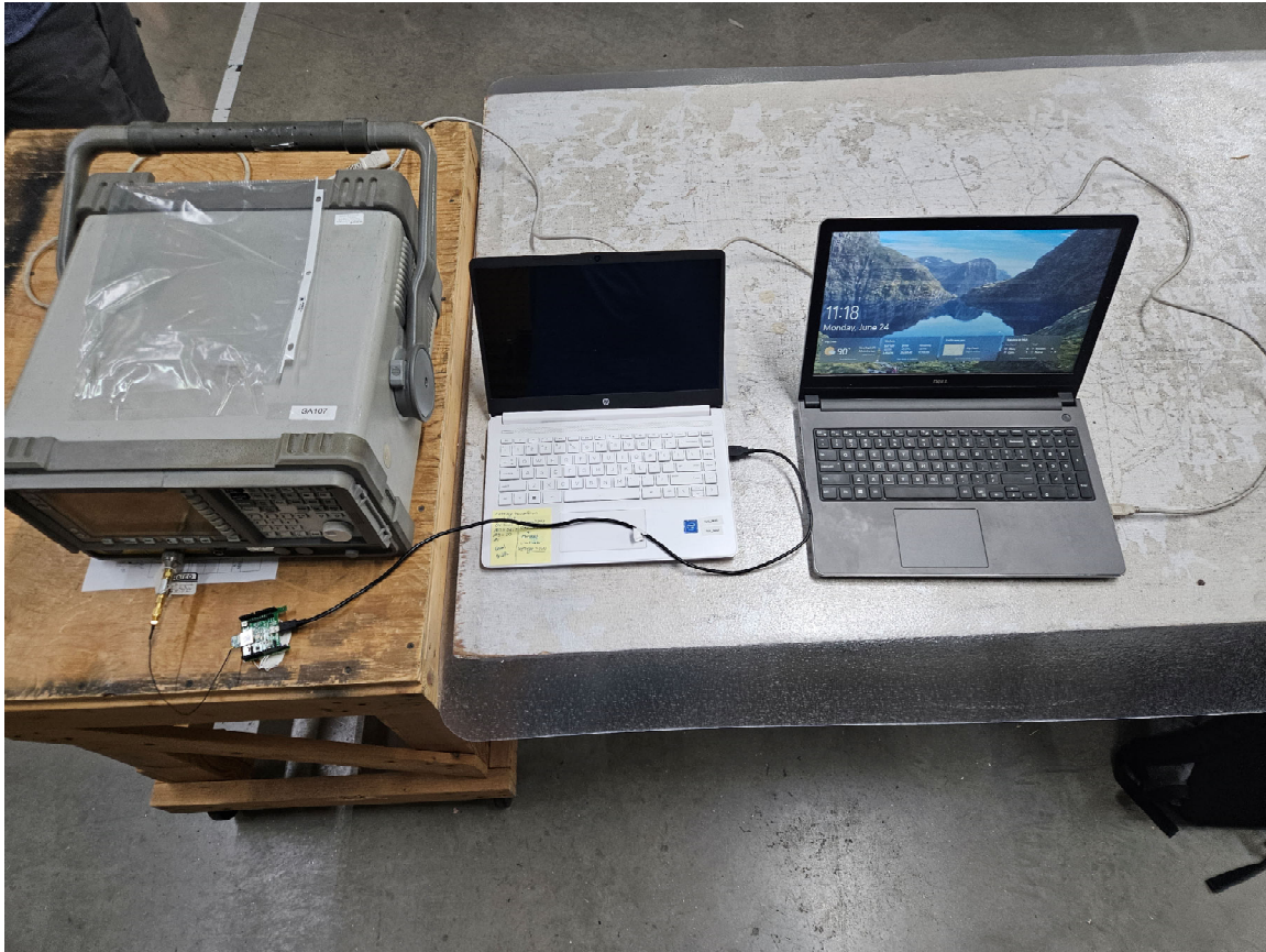
Figure 6. Conducted Bench Emissions Test Setup

FCC Part 15 Certification/ RSS 247 O7P-341 10147A-341 24-0073 July 18, 2024 Inventek Systems ISM4334X-M4G-L44 Module