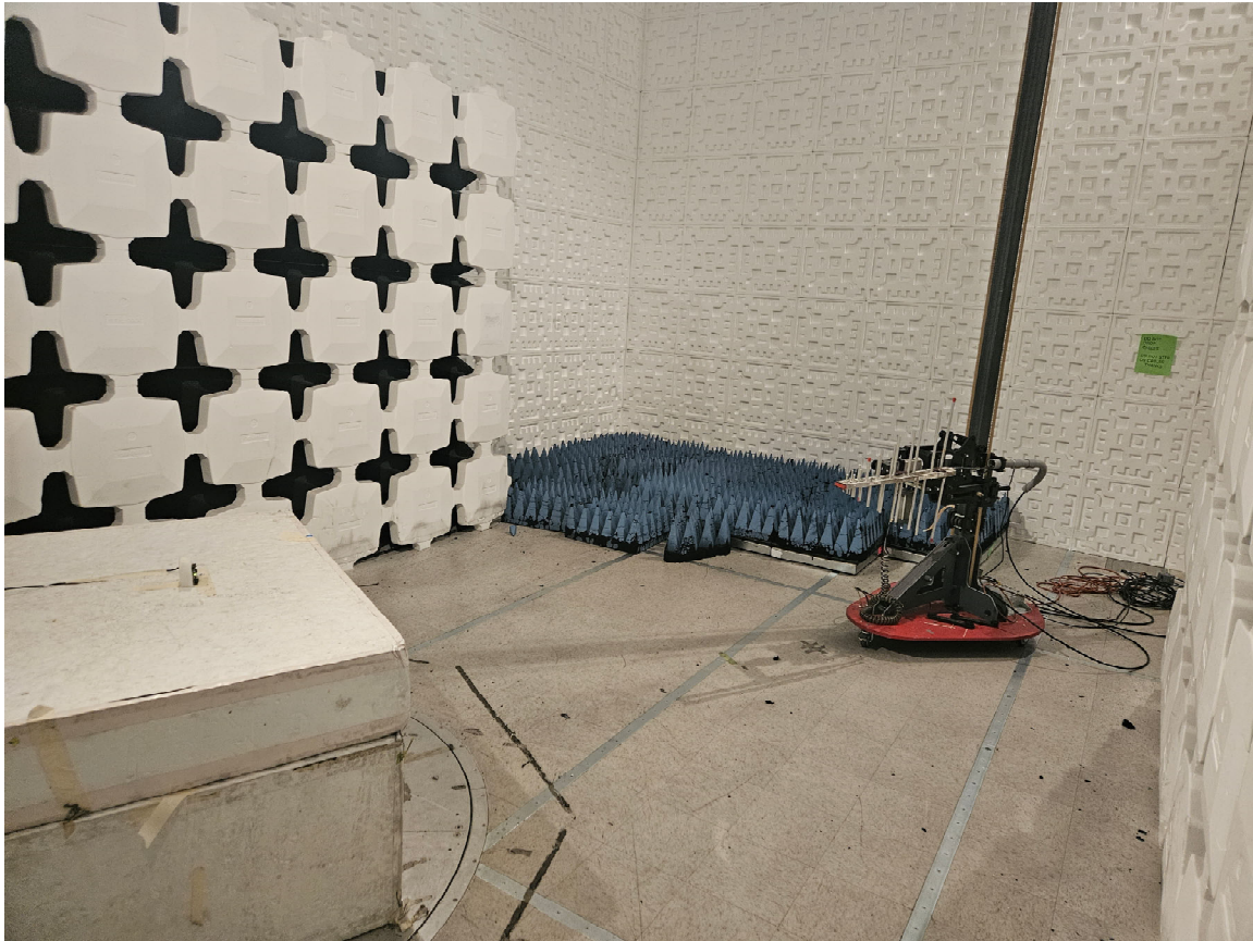
Figure 4. Radiated Emissions Test Setup, 200 MHz to 1GHz, Back

FCC Part 15 Certification/ RSS 247 O7P-341 10147A-341 24-0073 July 18, 2024 Inventek Systems ISM4334X-M4G-L44 Module