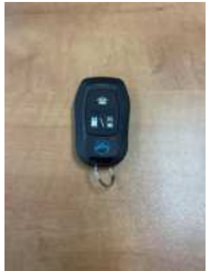
Figure 3 AW18