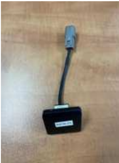
Figure 2 AW26