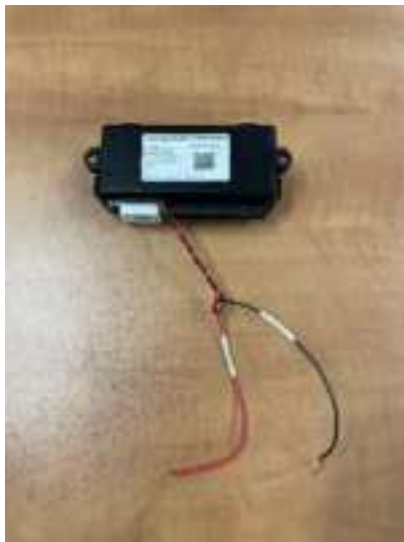
Figure 1 AX09