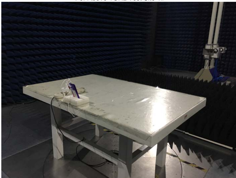
For Above 1GHz Test Site 1#