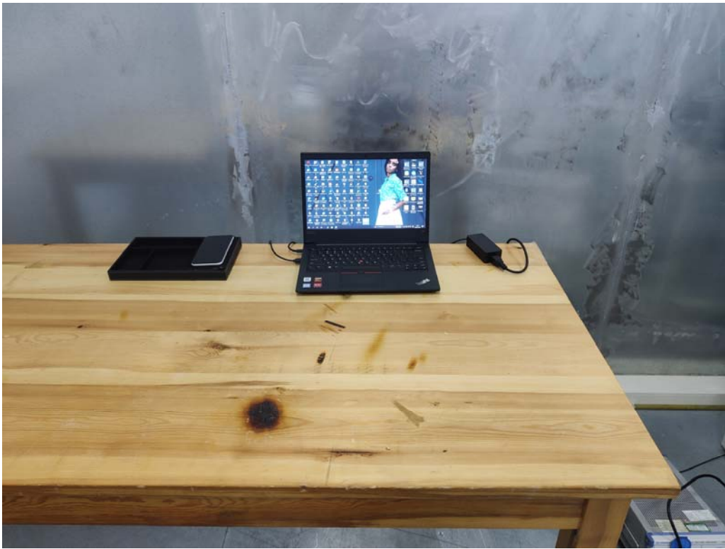
Conducted Emission-PC charge mode