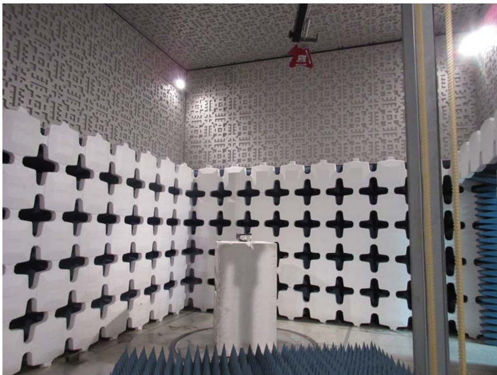
Test Setup for Radiated Emissions, 1 to 5GHz – Vertical Polarization